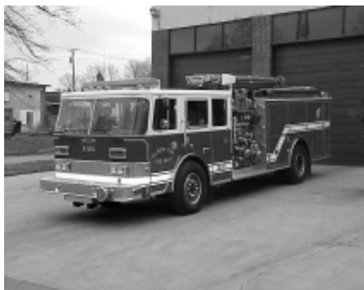
E551 1985 PIERCE ARROW

Also On-spot chains were added to the apparatus to facilitate inclement weather emergency driving.